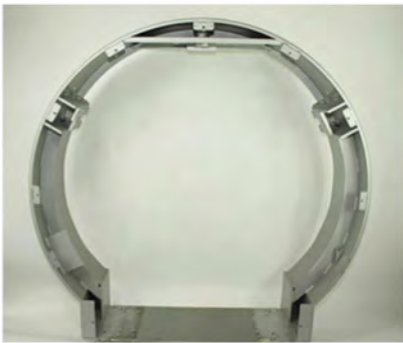
Ring housing for a medical imaging machine, 68" diameter X 20", GMAW / MIG welded, 25 pcs assembly that has been painted. Tolerances as tight as 0.020".

These components meet all regulatory standards and are suitable for patient use in offices, hospitals, and labs. We provide a superior fabricating service for components that are integral parts of high-tech medical and laboratory equipment.