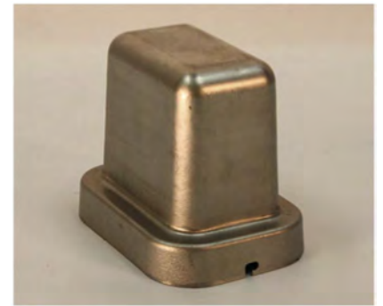
18 gage 316 s/s rectangular part, 4.10" height X 2.80" wide X 2.00" long, Part made via hydroforming.